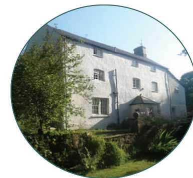
Church Farm Guesthouse

PLUS POSTMAN'S PATHS ON MITCHEL TROY COMMON