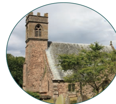
Church of St Michael and All Angels