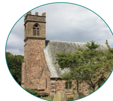
Church of St Michael and All Angels