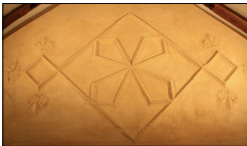
Lime plasterwork in the Chapel at Lydart Farm

(5) and then (wrongly drawn on the OS map) across the field and up a stream to