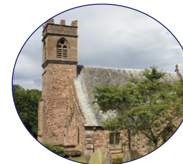
Church of St Michael and All Angels