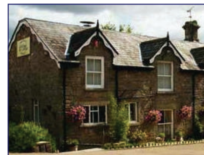
The Inn at Penallt www.theinnatpenallt.co.uk 01600 772765 Bar meals: Friday and weekends, plus Wednesday & Thursday in summer 12 noon to 3:00pm

From here, by the stone mounting block, bear left down the road for about 200 yards to a gate and a stile on the right just before a cottage (8). Through the gate, go round and up a stony gully and over a stile leading into a field. Go on through a gate, past a converted barn and down an old green lane with some large oak trees, a gate part way down and walls of huge stones. At the bottom (9), next to a house, cross the track coming in from the left and go over the stile, continuing up through a young woodland on a permissive track and over a stile on to a road. Cross the road and continue up the stony gully and path to another road.